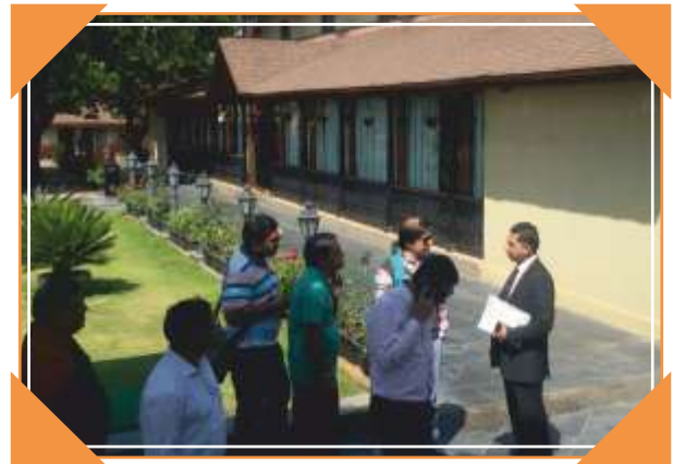
Venue inspection, Mahabaleshwar - Inspecting Banquet Area