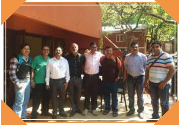
Venue inspection, Mahabaleshwar - Organizing Committee with Confidence