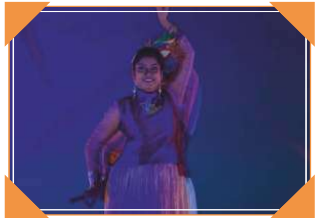
ACSICON 2015 - Cultural Night