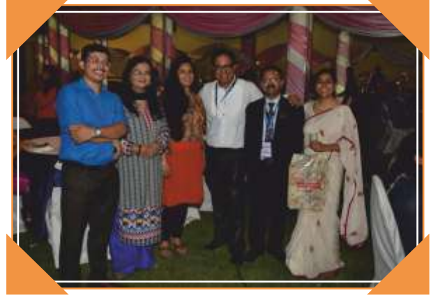
ACSICON 2015 - Banquet Time