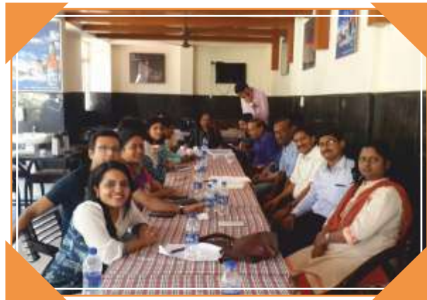
WCOCD 2017 - Preliminary Meeting of the Organizing Committee