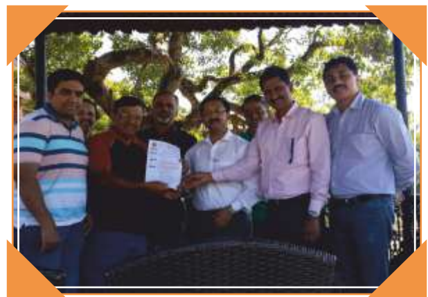
Venue inspection, Mahabaleshwar - MoU Signed between ACS(I) and Organizing Committee