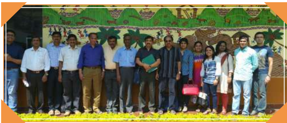
WCOCD 2017 - Organizing Team