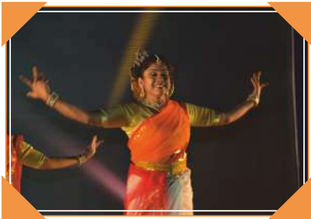
ACSICON 2015 - Cultural Night