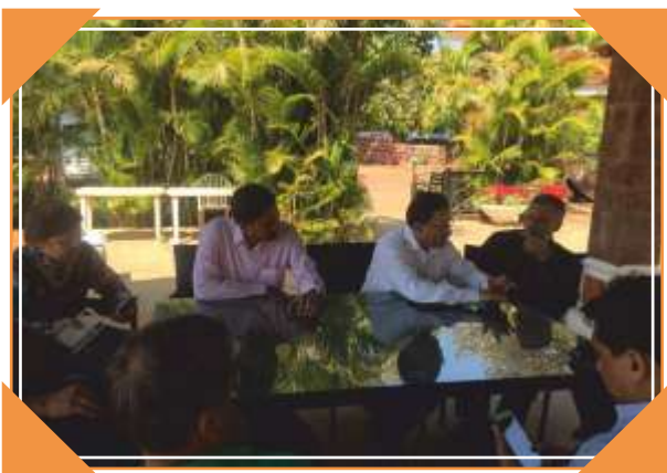
Venue inspection, Mahabaleshwar - Discussion on arrangements