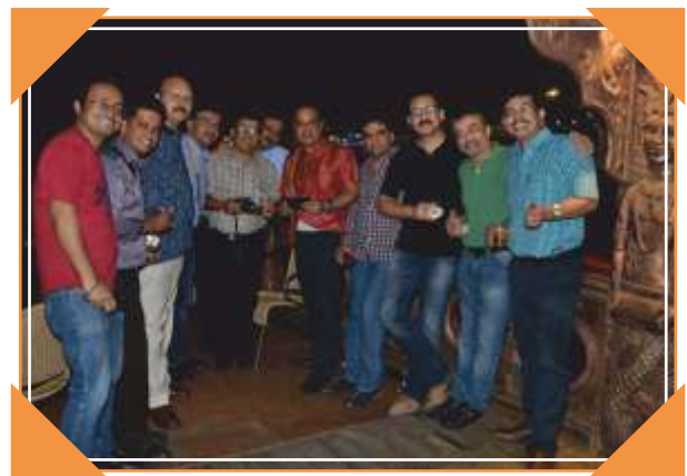
ACSICON 2015 - Faculty Dinner in Boat House