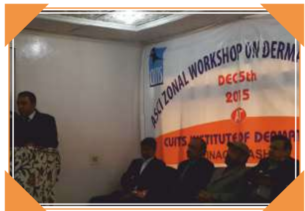
Zonal Focused Workshop (Srinagar) - Inauguration - First Zonal Workshop at CUTIS, Srinagar