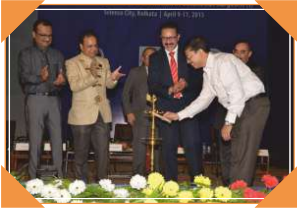
ACSICON 2015 - Inauguration of ACSICON 2016