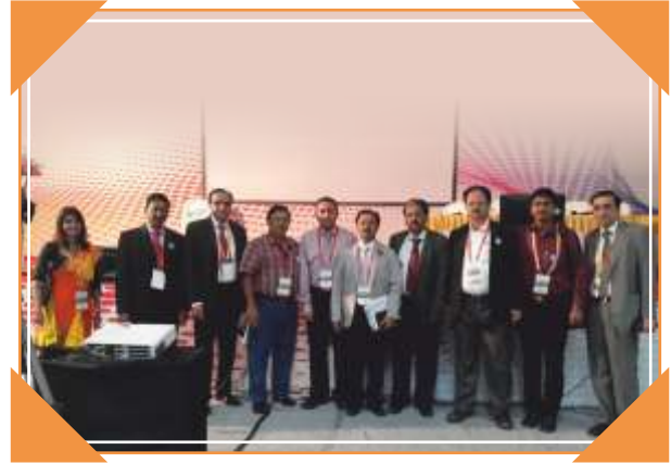
ACS(I) Central Council Meeting, Coimbatore 2016