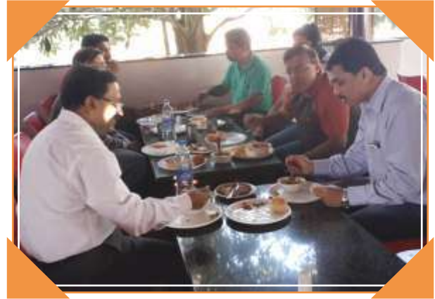
Venue inspection, Mahabaleshwar - Morning Breakfast of Maharashtra Special