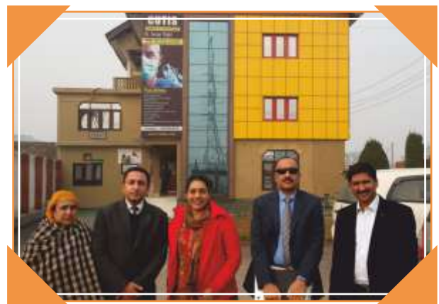
Inspection Team for Centre Recognition for Fellowship- Srinagar