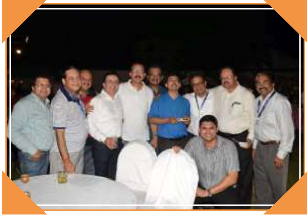
ACSICON 2015 - Stalwarts in Banquet