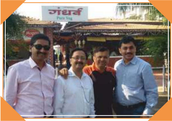
Venue inspection, Mahabaleshwar - Organizing Chairman with Inspection Team on the way to Venue