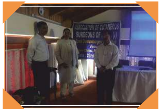
Zonal Focused Workshop (Shillong) - Expert Faculty on Discussion