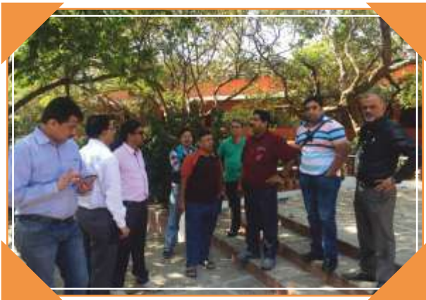
Venue inspection, Mahabaleshwar - Inspecting Trade Area