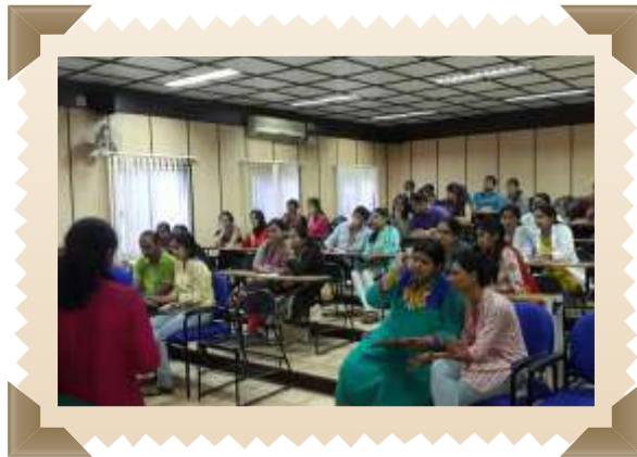
ACS(I) WCOCD DRL International Dermatosurgery Quiz Bengaluru