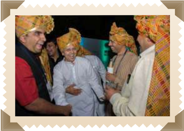
Organizing Committee in ethnic dress code