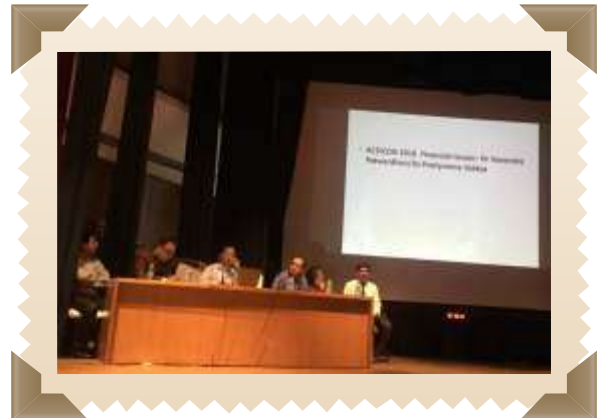
CC Meeting Where major decision were taken