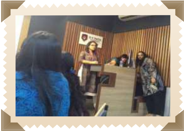
ACS(I) WCOCD DRL International Dermatosurgery Quiz Ahemedabad