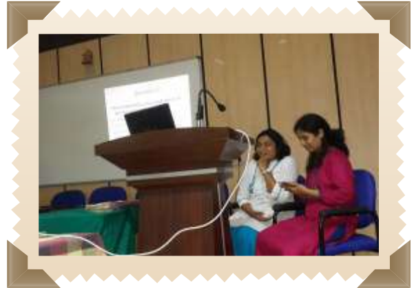
ACS(I) WCOCD DRL International Dermatosurgery Quiz Bengaluru