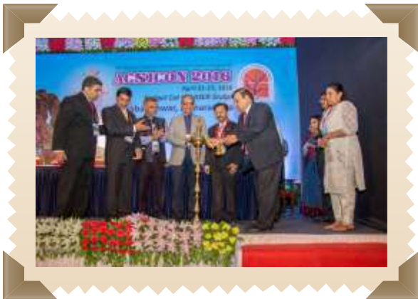
Inauguration -ACSICON 2016

The scientific programme was of a very high standard and had focussed sessions on ulcers, nail,ear,acne, antiageing, periorbital rejuvenation, advanced surgery. All the scientific sessions had a very good response from the delegates in all 3 halls. The sessions started right on time & finished in time too. A big thanks to all the speakers for that!