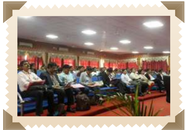
South Zone Dermatosurgery Workshop - Packed hall till the end