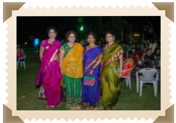
Organizing committee in traditional dress