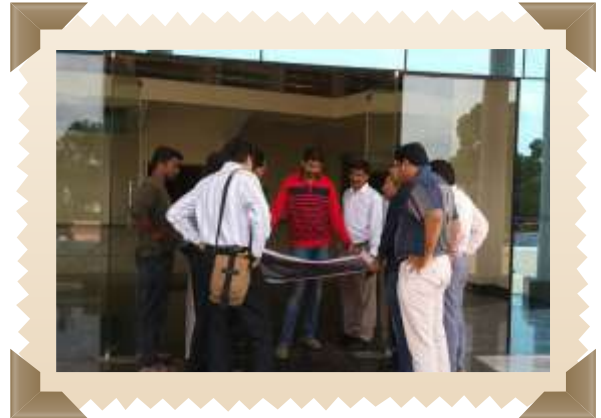
WCOCD 2017/ ACSICON 2017 Venue Inspection