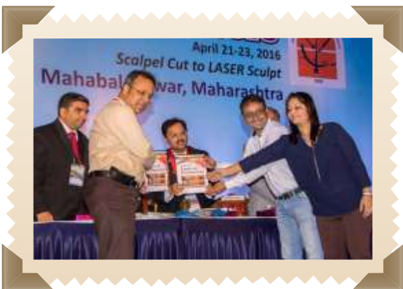
The Award Paper session, ACSI innovation award & free paper sessions showcased the immense talent of our Indian Dermatosurgeons!