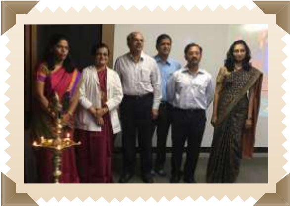
Inauguration of the workshop