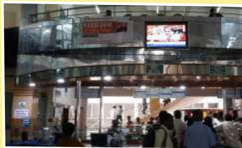
Bengaluru- Rajarajeshwari Medical College and Hospital