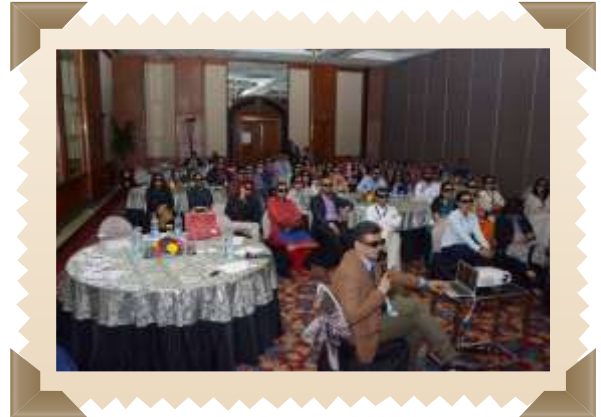
Delegates keenly observing the 3 D video demonstration