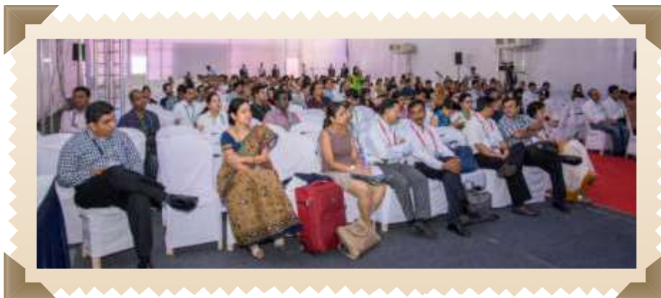
Main hall packed with delegates throughout the conference due to interesting lectures