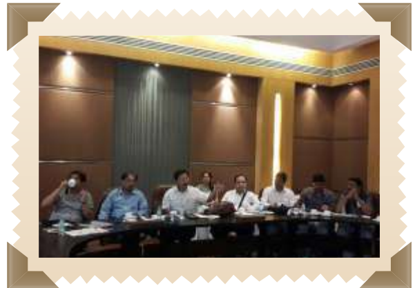
WCOCD 2017/ ACSICON 2017 Venue Inspection: Scientific Meeting at Hotel Lalit Ashok