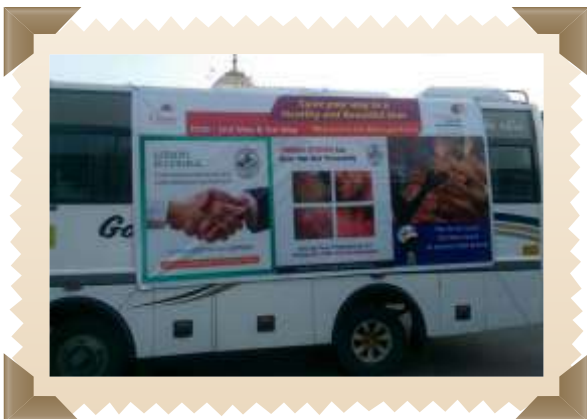
DERMABUS- taking message of 'skin care' to public-2nd May 2017