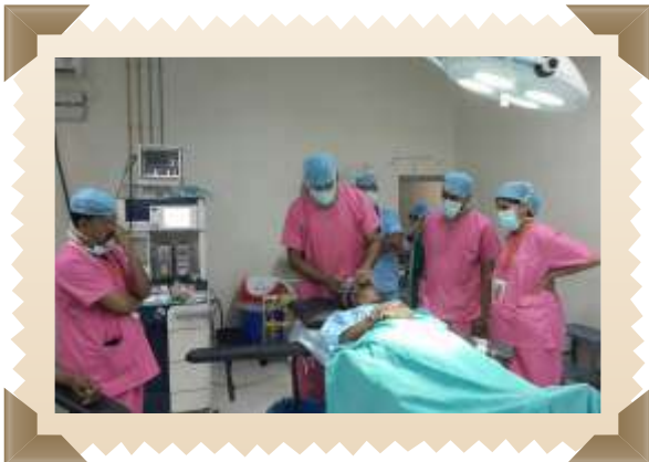
Anesthesia Blocks - Demonstrated by anesthetist