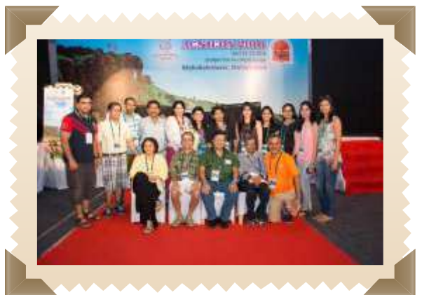
The dress code for the delegates & faculty too (smart & summer casuals for academics, traditional for banquet) was a super hit with all. Probably the first of its kind in an Indian Dermatosurgery Conference!