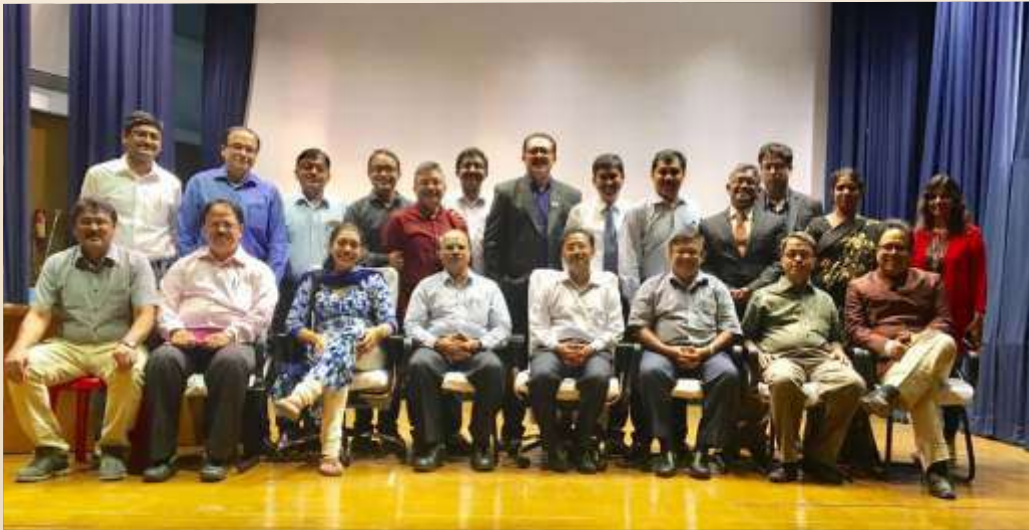
Central Council Committee