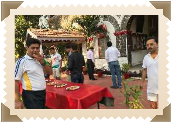
Morning breakfast before CC meeting at beautiful lawn