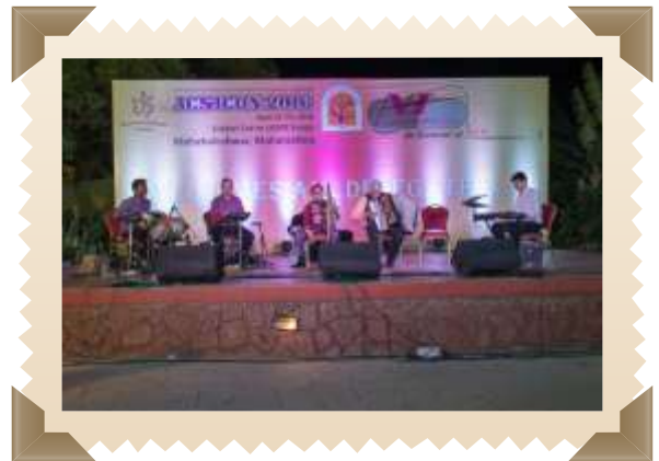
Going by the theme of the conference -' academics with fun & frolic' a memorable gala dinner and banquet at the lovely MPG club.