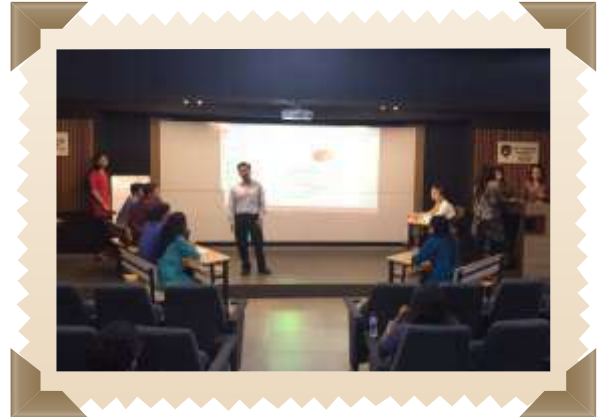
Zonal level held during west zone workshop