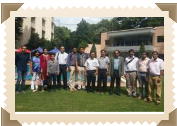
Organizing Committee with Central Inspection Team