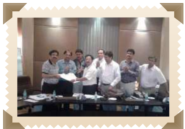
Legacy continues - MoU signed