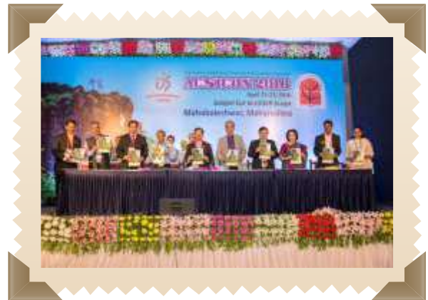
Releasing ACSIPEN 2016