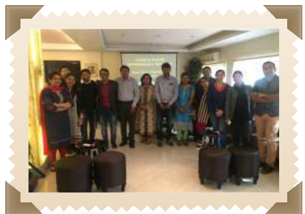
Organizing team with faculty