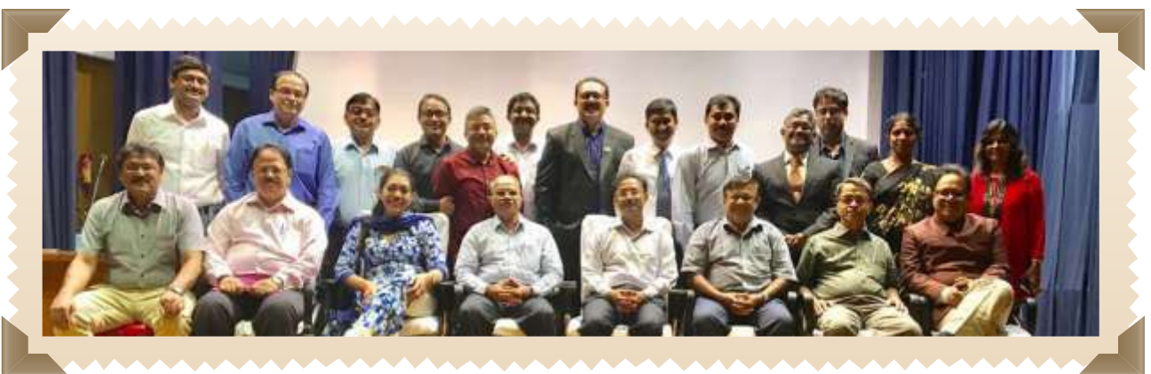
CC Members Participated, Navi Mumbai