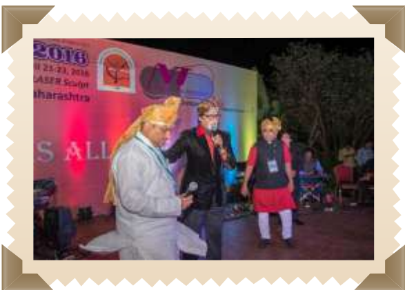
Cultural evening during Banquet