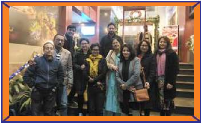
Team ACSICON 2020, Guwahati