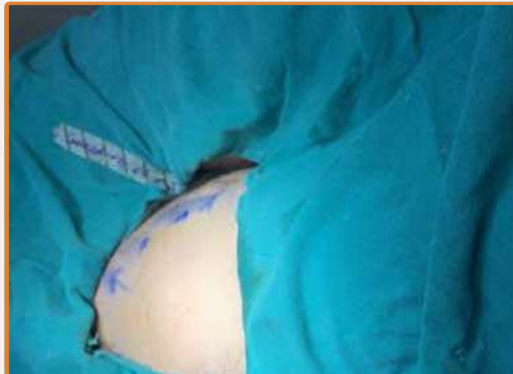
Fat Transfer Procedure