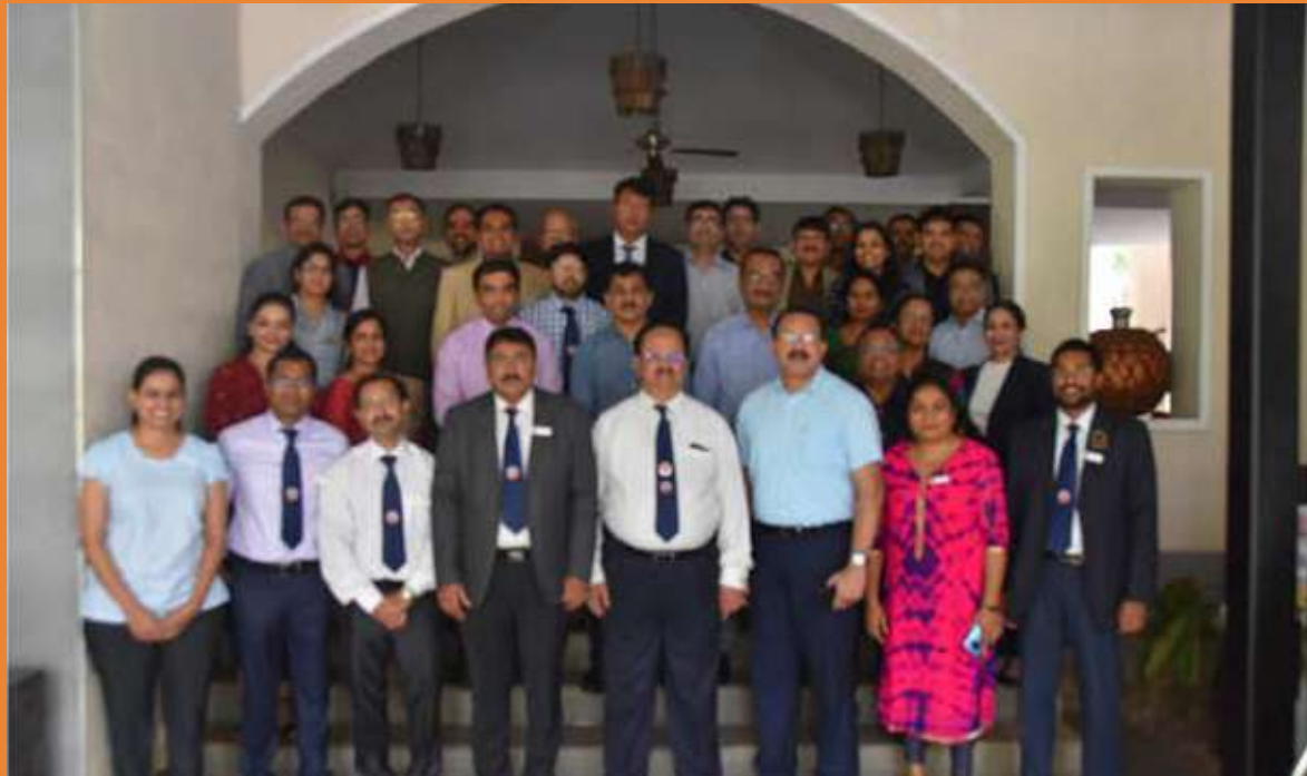
Central Council Committee