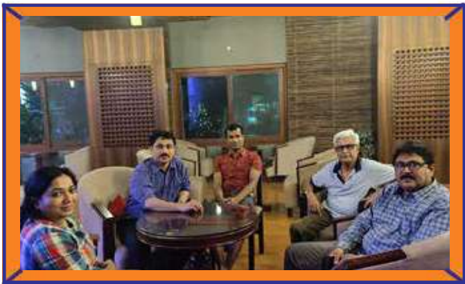
ACSICON 2021, Wayanad venue inspection